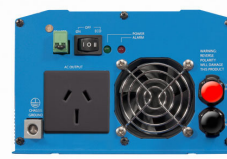
Phoenix Inverter 12/800 with AN/NZS 3112 socket