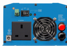
Phoenix Inverter 12/800 with BS 1363 socket