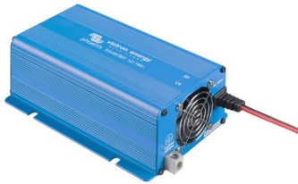
Phoenix Inverter 12/180