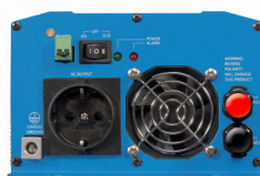
Phoenix Inverter 12/800 with Schuko socket