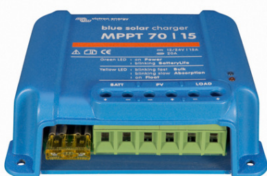
Solar charge controller MPPT 70/15